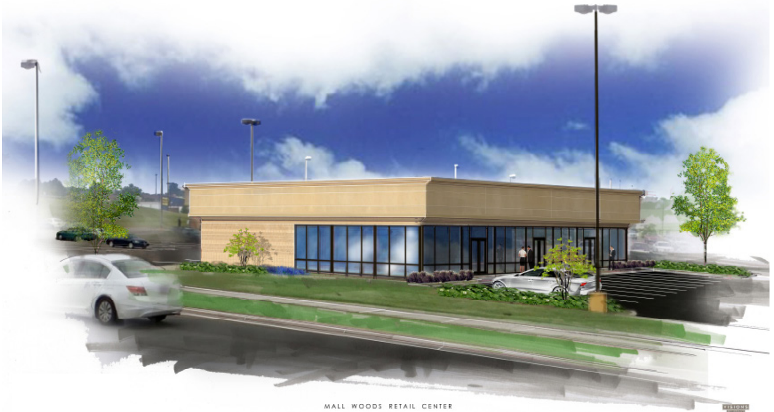
MALL WOODS RETAIL CENTER