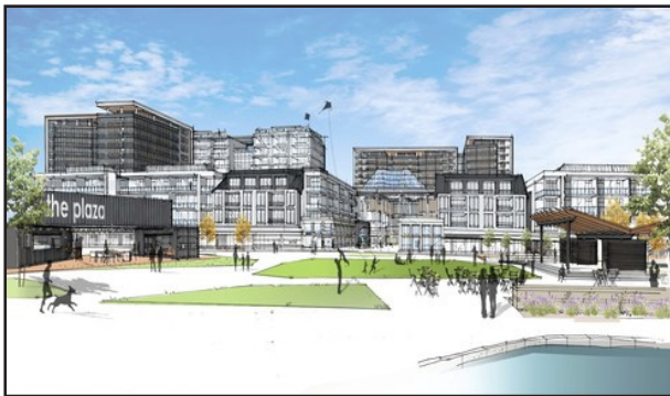
Exterior rendering of the future redevelopment.

SPRINGDALE, Ohio, March 8, 2022 / PRNewswire/ -- MarketSpace Capital and Park Harbor Capital announced today the official closing of their purchase of Tri-County Mall, located in Springdale, OH. This important milestone signifies the transfer of ownership to the Texas-based co-developers and the beginning of a new era for one of Greater Cincinnati's most recognized destinations.