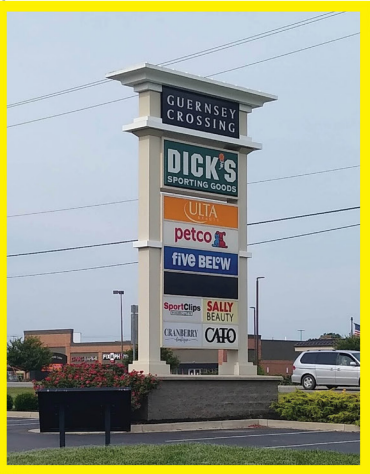
Pylon Signage Overall Height 30 Feet